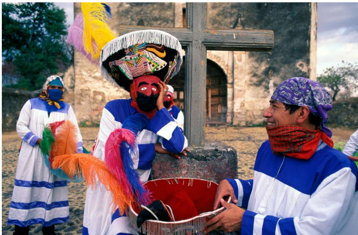
Foto Chinelos celebrations in the Tepoztlan Carnival, Morelos. México

This approach will confirm that no tangible heritage conservation issues will impact on the integrity of its associated intangible cultural heritage.