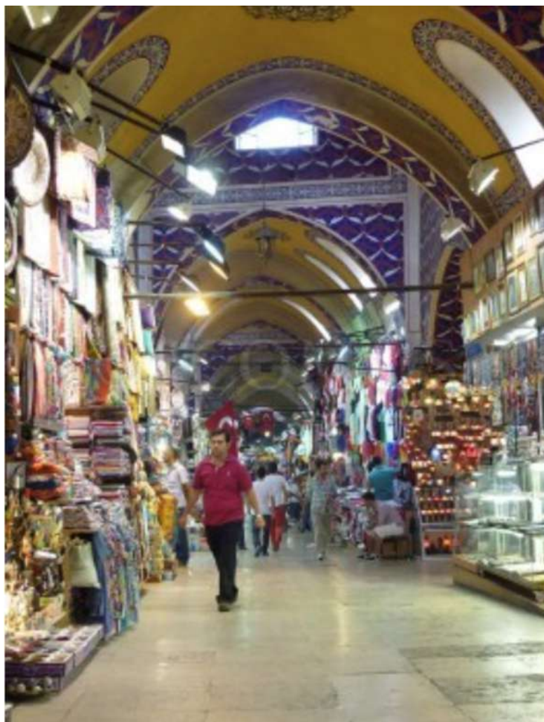
Miel Delphine/ICOMOS https://www.icomos.org/fr/mediatheque https://www.icomos.org/en/313-contents/medias/heritage-typologies/h...rand-

Those members of a community with a special relationship and responsibility towards intangible cultural heritage, its practice, protection and continuity, and often for a place where such intangible heritage values reside.